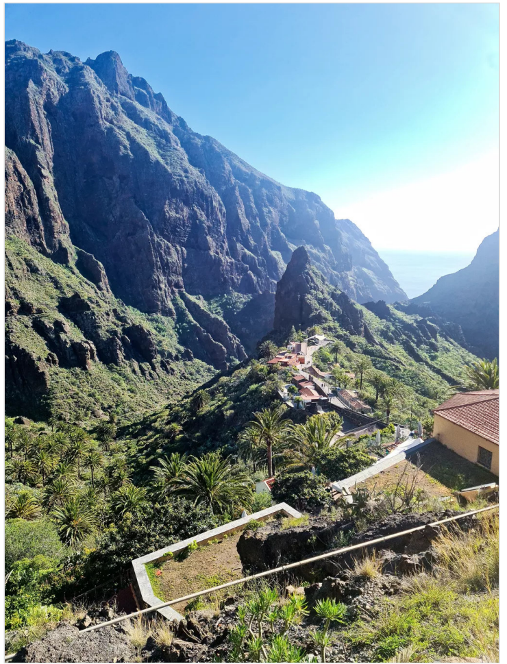
Tour of the city