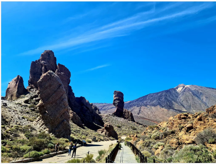
Puerto Cruz e Teide